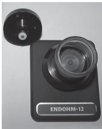
Fig. 5—Properly chlorided EndOhm (note the brighter color)