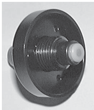
Fig. 7—Notice the center tip and the small ring on the top section. These may require the use of a cotton swab to clean.