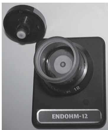
Fig. 4—EndoHM-12 shown that has not been chlorided enough