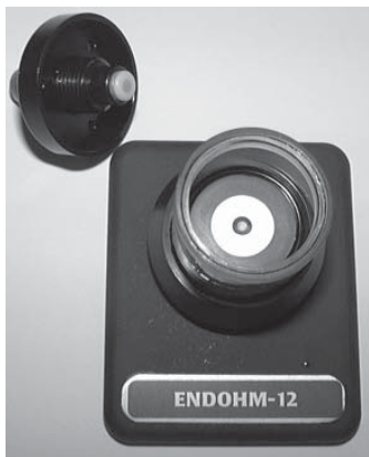
Fig. 6—Clean EndOhm surface with no spots or irregularities

NOTE: Do not use any solution of ammonia/water stronger than 5%.