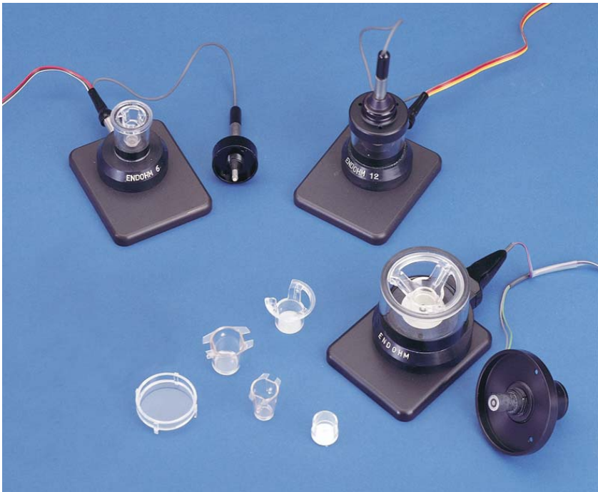
Fig. 1—Endohm-6, Endohm-12 and Endohm-24

NOTES and TIPS contain helpful information.