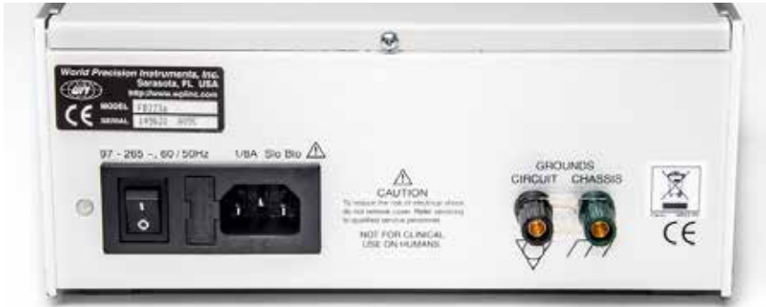
Fig. 4—The rear panel of the FD223a has the power ports and the grounding pins.

Grounds: Chassis and Circuit —Rear panel connectors are available for CHASSIS and CIRCUIT GROUNDS. The preparation bath ground should be connected to the CIRCUIT GROUND via an appropriate electrode.