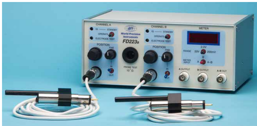
Fig. 1—The FD223a dual channel electrometer comes with both probes.

NOTES and TIPS contain helpful information.