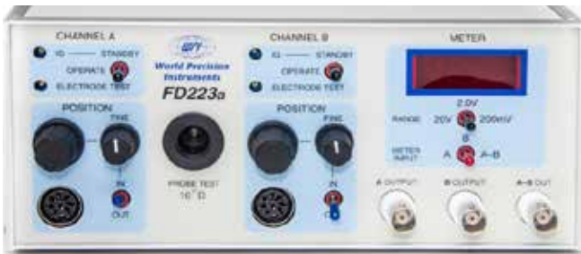
Fig. 3—The front panel of the FD223a has the controls.

The FD223a front panel is comprised of inputs and controls for CHANNEL A , CHANNEL B , the Probe Test circuit, the Meter block, and the Output BNC block.