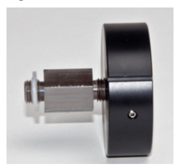
Fig. 4—The short side of the adapter fits into the collar.

3. Notice that the threads on the adapter are the same, but one side is longer. Place the washer on the side of the adaptor with the longest length of threads. (Fig. 4.)