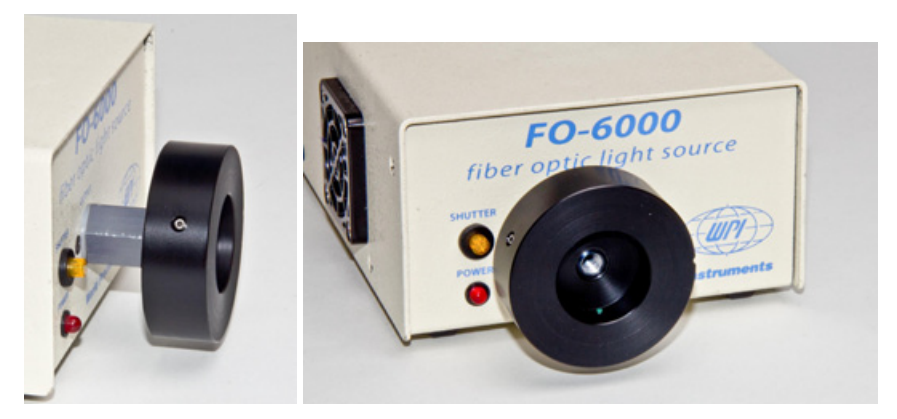
Fig. 5—(left)The adapter (with the washer installed) fits into the FO-6000 Output connector. Fig. 6—(right) The filter slides into the collar and the three filter retaining screws hold it in place.

5. Screw the other end of the adapter (with the washer installed) into the Output connection on the front of the FO-6000 . (Fig. 5.) Tighten it finger tight to prevent stray light from entering the unit.