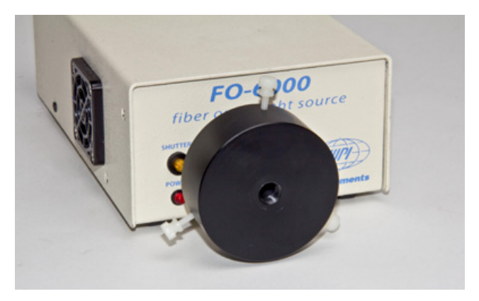
Fig. 7—When the housing is installed, secure it with the white screws.

8. Screw the collimator (taken from the FO-6000) into the housing.