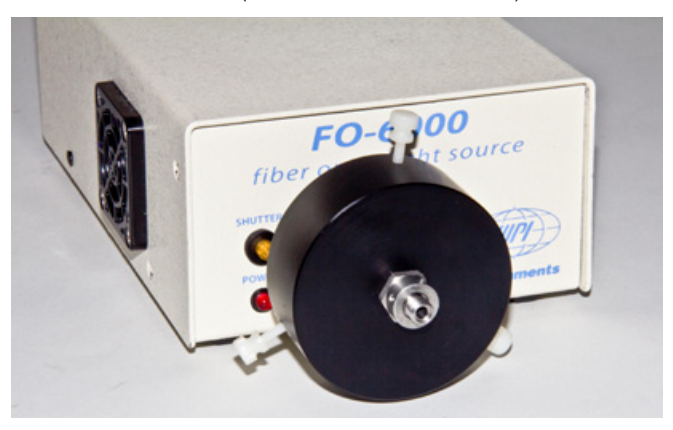
Fig. 8—Once the collimator is installed, the unit is ready.

8. Screw the collimator (taken from the FO-6000) into the housing.