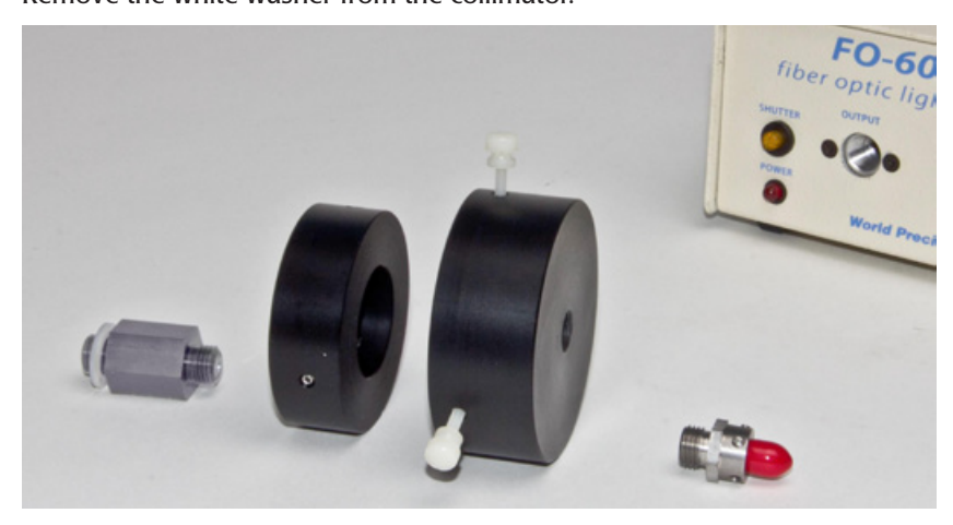
Fig. 3—Remove the collimator from the FO-6000.