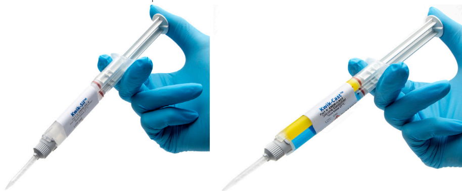
Fig. 1—KWIK-SIL (left) and KWIK-CAST (right) are packaged in an easy-to-use dual-syringe applicator which eliminates the introduction of air bubbles during mixing and causes a more consistent curing time.

NOTES and TIPS contain helpful information.