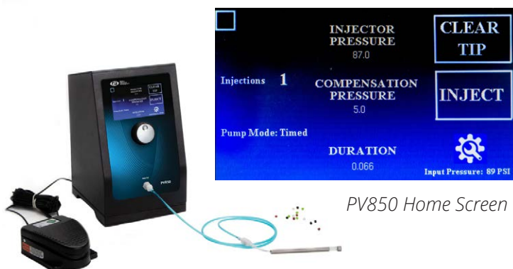
PV850 Home Screen

The WPI Microinjectors offers separate regulated compensation (back filling prevention) and ejection pressures with a precision timing circuit that switches from injection pressure to compensation pressure automatically.