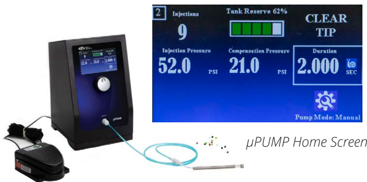
µPUMP Home Screen

Timing, injection pressure and compensation pressure are adjusted independently using the touch screen interface. Time intervals can range from 2 seconds down to 10 ms or less, depending on the injection pressure setting. The injection pressure interval is triggered by using a foot switch or a computer-controlled TTL pulse.