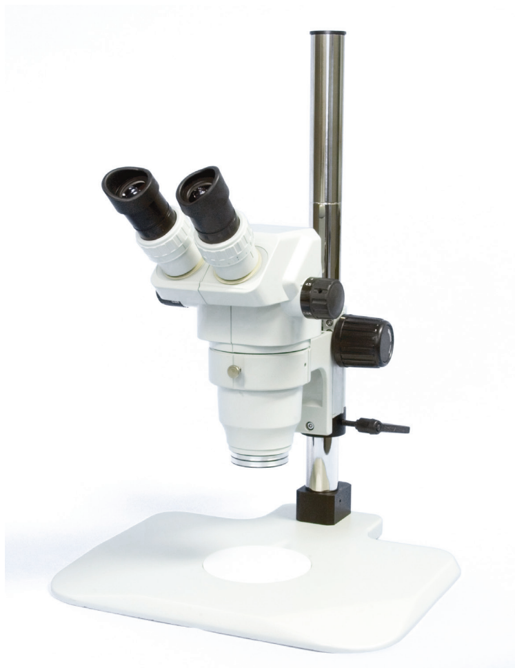
Fig. 1—The PZMIII binocular microscope is shown on its standard post stand.

NOTES and TIPS contain helpful information.