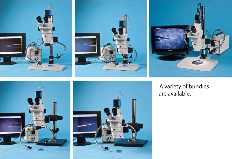
A variety of bundles are available.

When not in use, remove the eyepieces and put them back into the lens box. Replace them with the eyepiece tube dust covers. The microscope should then be secured in its box or covered with a dust cover.