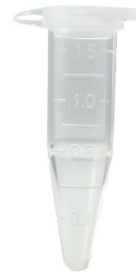
503530 Microcentrifuge tube (1.5 mL)