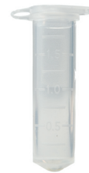
503531 Microcentrifuge tube (2.0 mL)